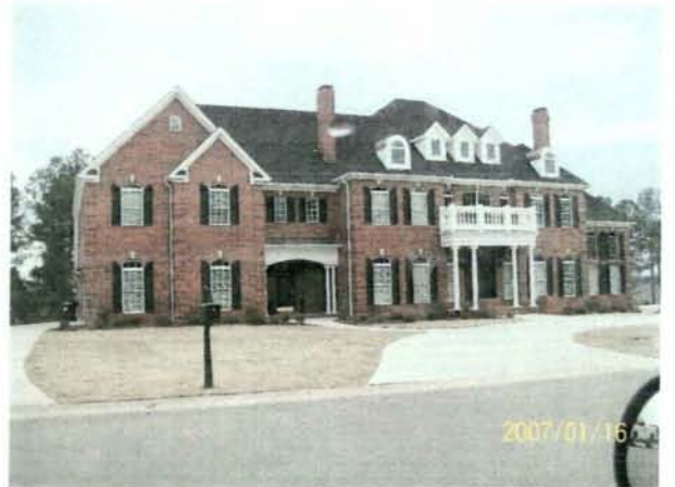
4835 Bayhill Watson Homes