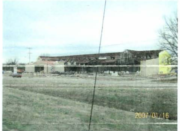
200 Amity Road Furniture Row C. R. Crawford