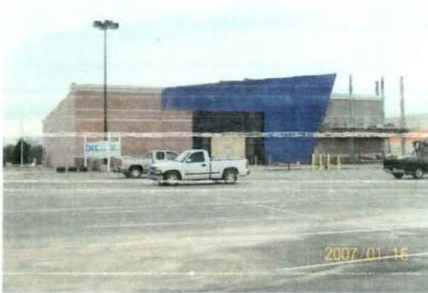
600 Elsinger Best Buy Bell Corley Construction