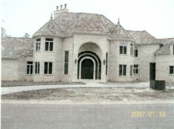
4815 Bayhill Elms-Clowers Construction