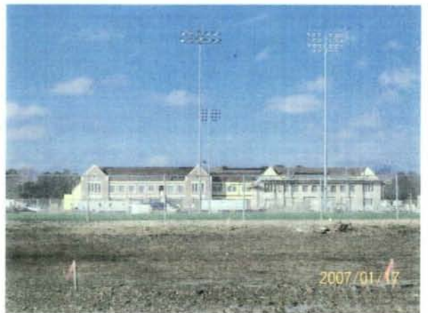
1500 Harkrider Wellness Center Nabholz