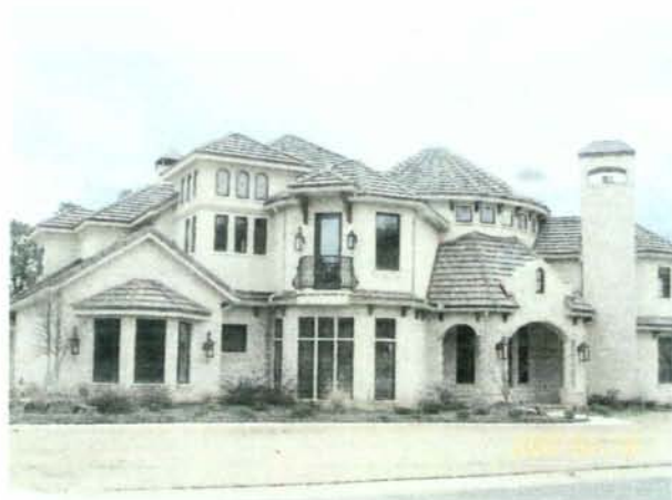
4905 Bayhill Drive Elms-Clower's Construction