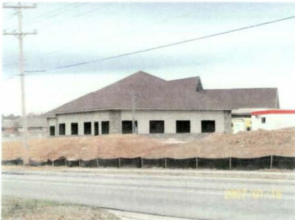
3020 College Doctor's Office Salter Construction