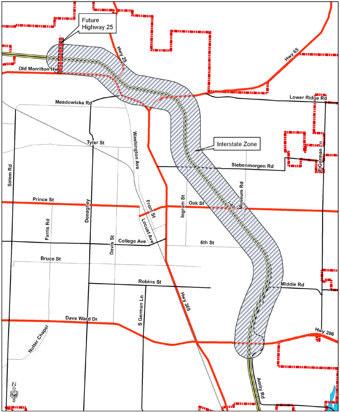
Interstate Sign Zone Appendix A